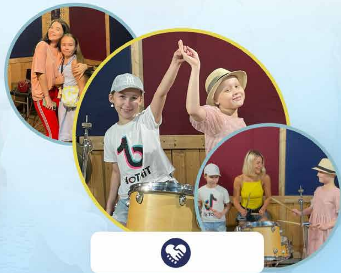
Filming of the video "Everything will be fine" on the cover of GeeGun song and support from the artist