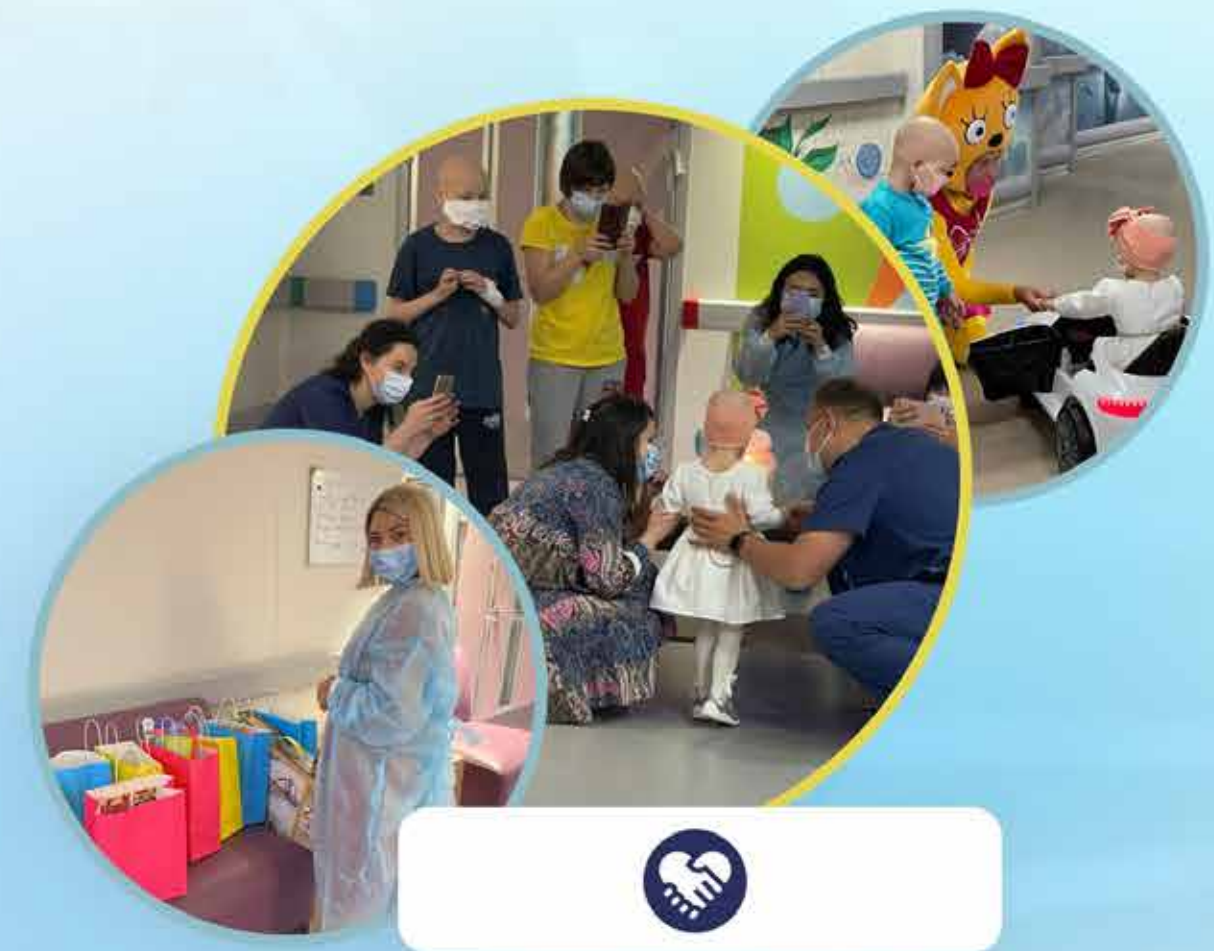
Assistance to children with cancer at the Ohmadit Medical Institution in Kyiv