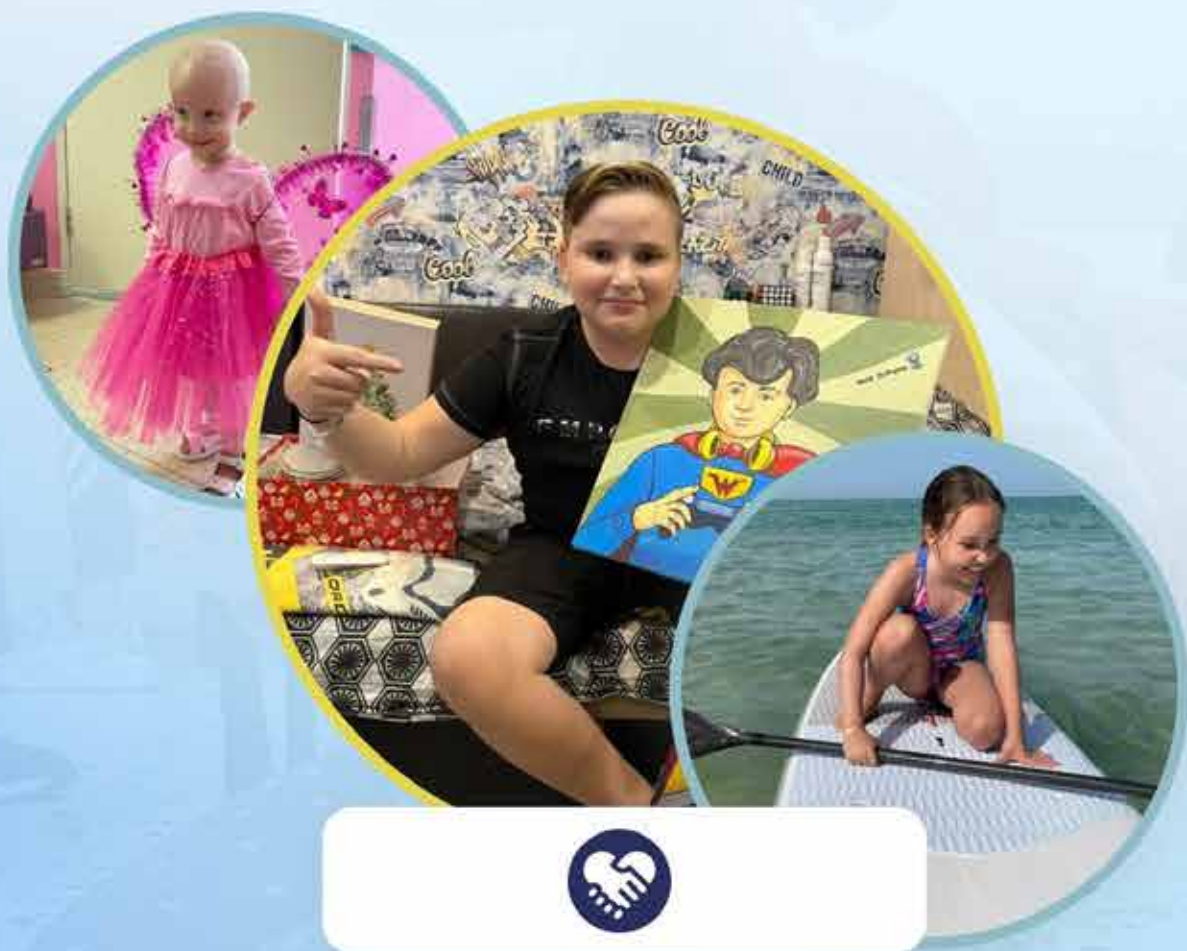
Realization of many childs' dreams