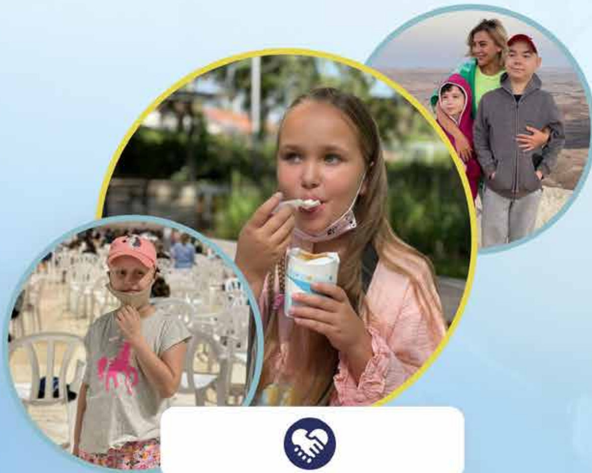
Excursions around Israel with the foundation's volunteers