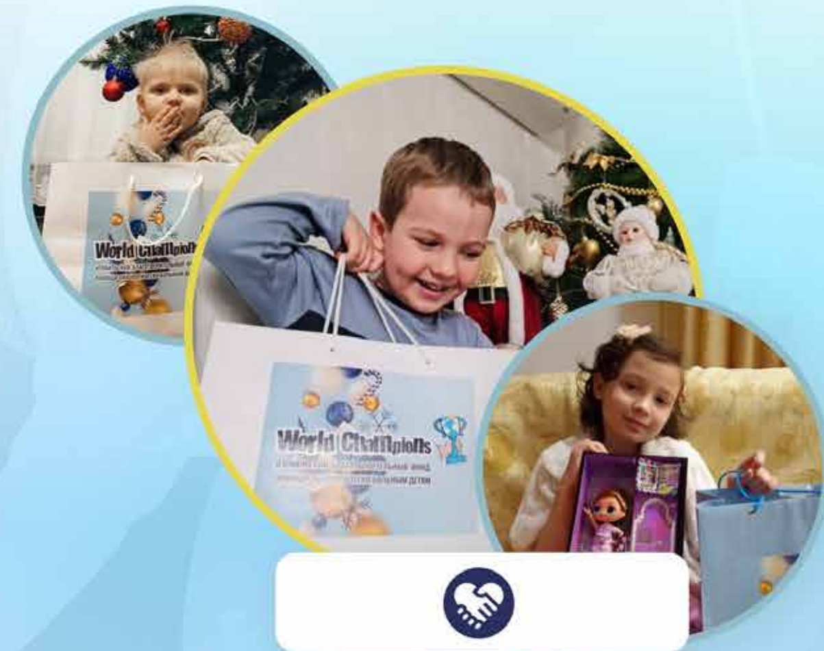
New Year's greetings to children and New Year's musical in Ukraine, for children who have returned from Israel