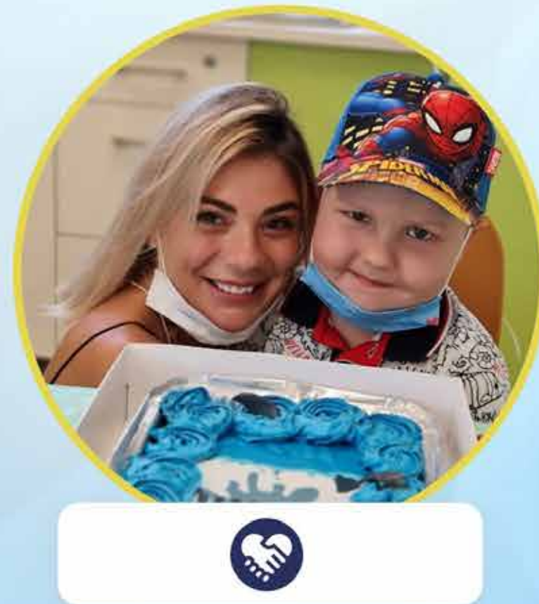
Master classes for children together with foundation volunteers